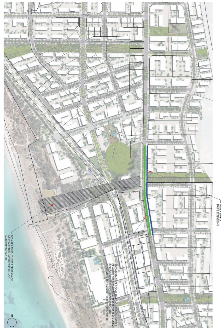
Figure 76_5-10 Year Infrastructure Staging