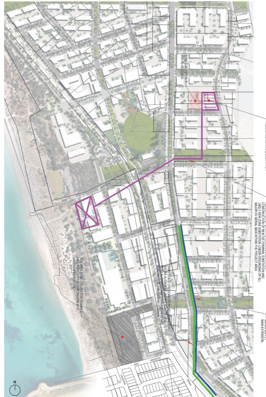
Figure 77_10-15 Year Infrastructure Staging