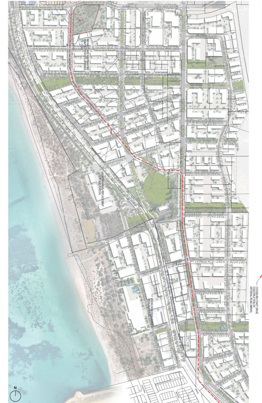
Figure 78_+15 Year Infrastructure Staging