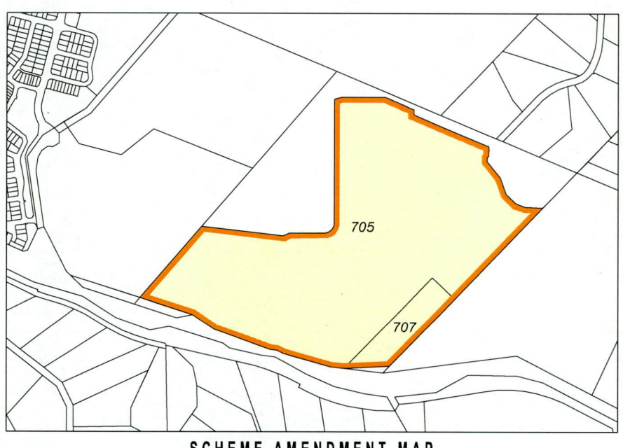
SCHEME AMENDMENT MAP