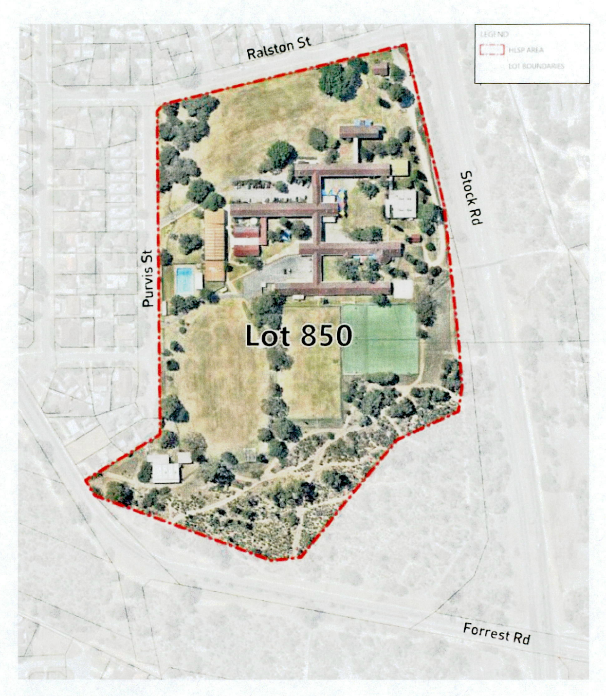
Figure 2 - Amendment Area