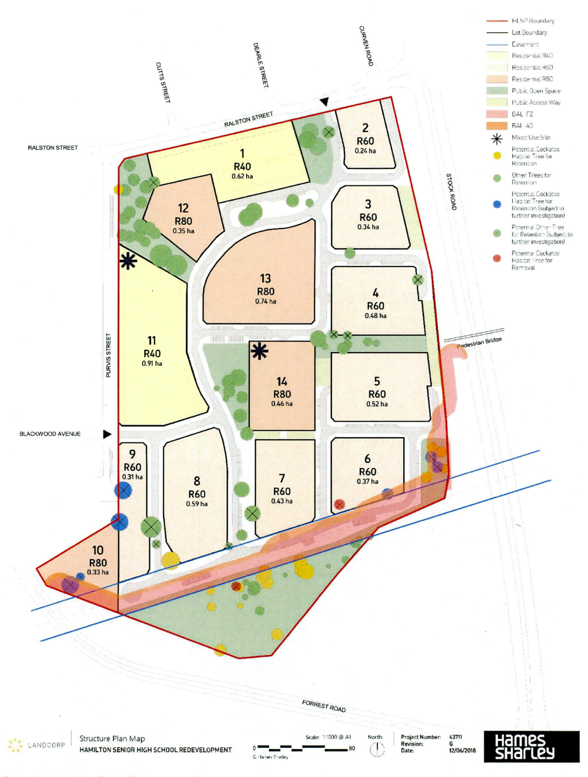
Figure 3 - Proposed Local Structure Plan