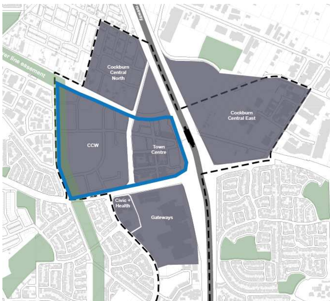
Figure 1: Cockburn Central precincts and area subject to the City's LPP Cockburn Central Percent for Art (shown in Blue).