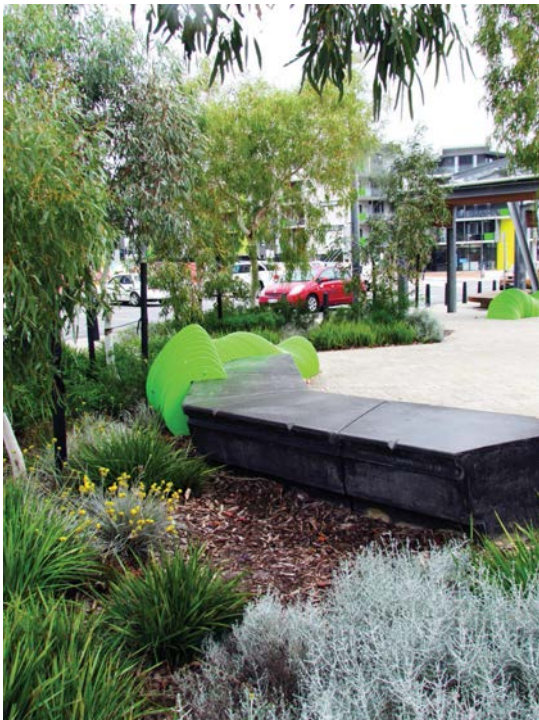
Above: Public art incorporated into a park bench at Cockburn Central Town Centre square

This Public Art Plan is seen as an important contributor in meeting these high level objectives.