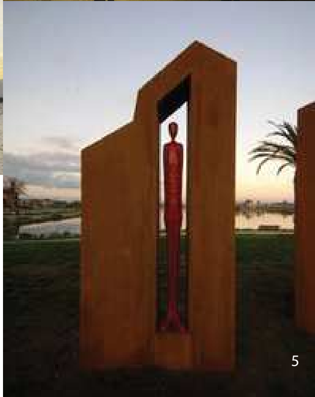
Segmented Landscape by Jennyfer Stratman (Right) draws on ideas of landscape, architecture and human connection. The figures represent peoples inherent interconnection with the land and with each other. The steel segments have naturally oxidised to a textured rusty surface and blend with the earthy hues of the surrounding area while the red figures provide a sharp visual contrast.