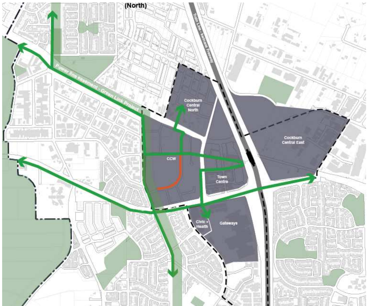
Figure 2: Regional connections theme alignment (green) and site specific artwork for Remembrance Avenue (orange)