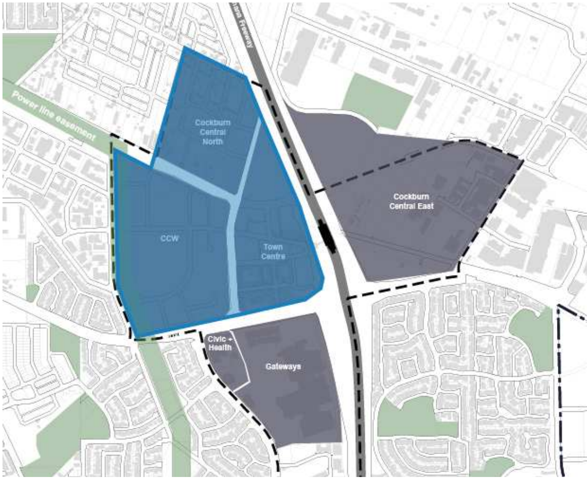
Figure 3 (above): Community theme (Blue). Figure 4 (below): Designated locations for public art at the ARC.