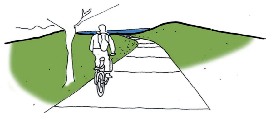
Elevating the pedestrian and cycling experience

It will be a collection of great streets and inspiring public places in which to explore and enjoy the Cockburn coast’s past.